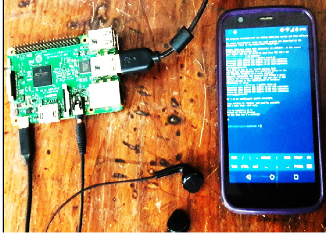
Fig. 3 Execution in Standalone system